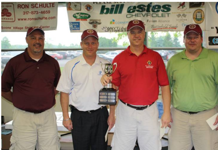
Top: Putting Contest qualifiers